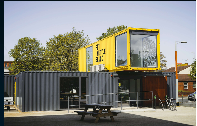
An example of containerized office space

We deliver the full container solution, including foundations, plumbing, electricals and finishes.