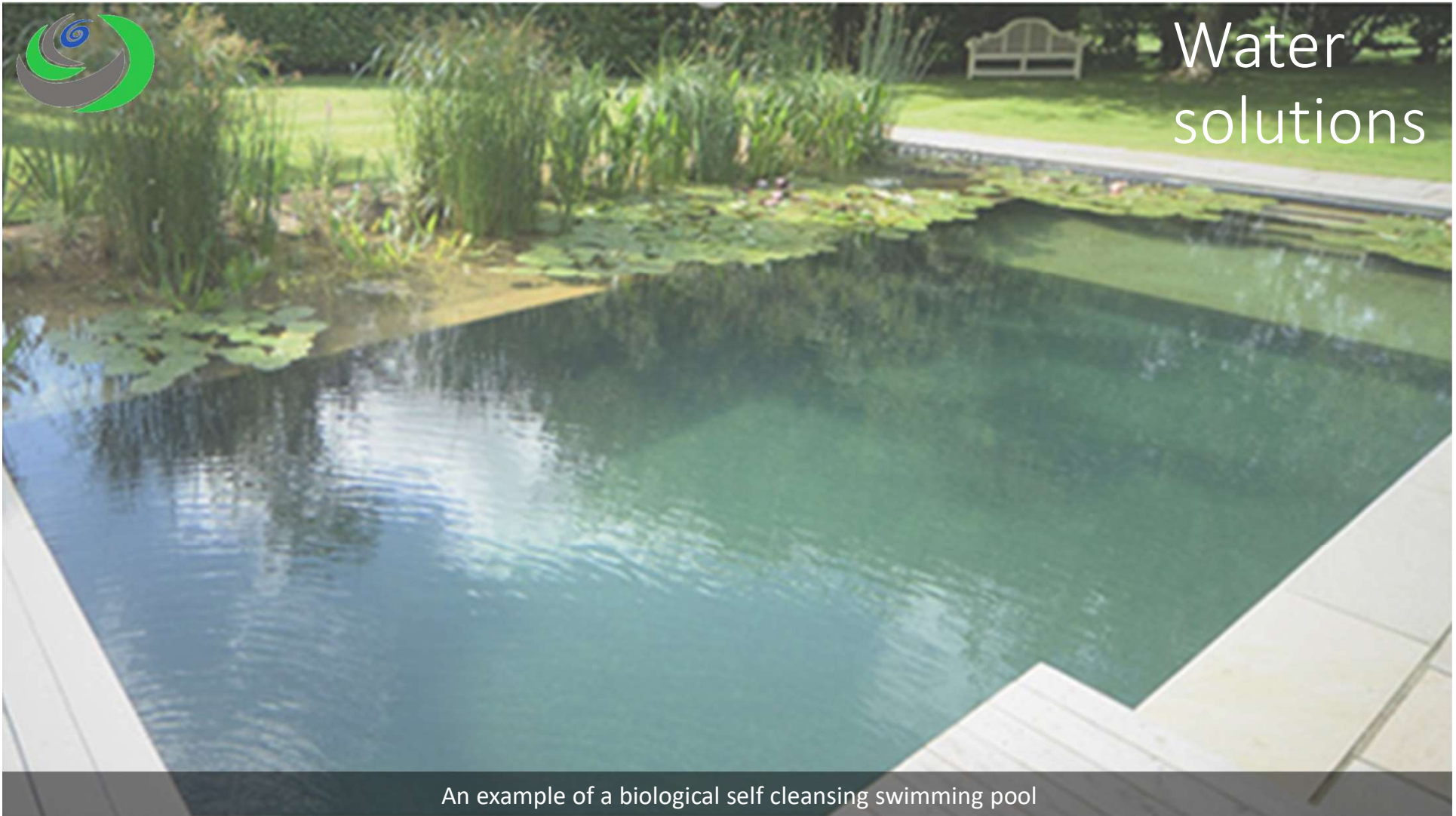
An example of a biological self cleansing swimming pool